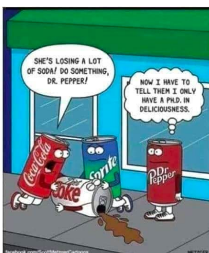
Soda truth was revealed. Dr Pepper only had a doctorate in theoretical Fizz-ics.