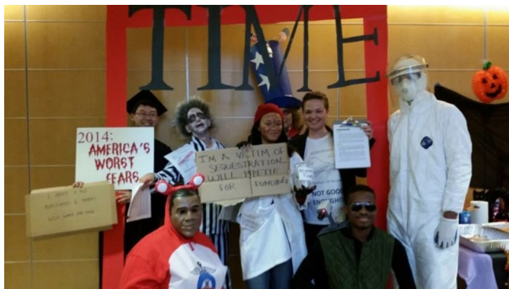
The Cone Lab took the prize as team winners in the costume contest.