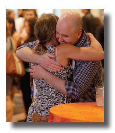
Friends reconnected at the 2017 BRET Reunion

Friday was dedicated to reunion events, so I kicked off the day with a quick run around the iconic three mile "Vandy loop" that borders the edges of campus, enjoying the view of buildings and parts of campus I recognized from the past alongside new buildings and restaurants that were unfamiliar to me. Back on campus, I snuck in some time to chat with former committee members before the 9am reunion "Morning of Discovery" presentations. The talks highlighted the latest and greatest happenings at Vanderbilt, specifically with the IGP and CBP programs. I was excited to hear that since I left in early 2013, the ASPIRE program had been created to help trainees navigate paths to new careers after completing their training. The Provost, several deans, and current faculty gave updates on the state of graduate education at Vanderbilt interspersed with impressive Three Minute Thesis (3MT)-style research talks by current BRET trainees. After the morning session, facility tours were offered - friends who attended gave rave reviews. I took the lunch hour to check in on my husband and baby before attending the Cell and Developmental Biology reunion event with my former lab mates and current Tyska lab members. Between the reunion events and dinner with the Tyska lab,