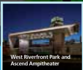
West Riverfront Park and Ascend Amphitheater