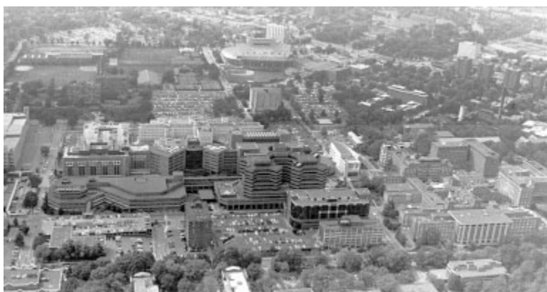
(Top) Vanderbilt University School of Medicine and Hospital, 1953. Newly constructed Learned Laboratory may be seen on the right (north) side of the main structure. (Bottom) Vanderbilt University Medical Center, 2003. In this view the 1953 structure is at the far right, partly masked by the facade of the Werthan Wing. (The view shown on the front cover is of the School of Medicine and Hospital in 1953.)